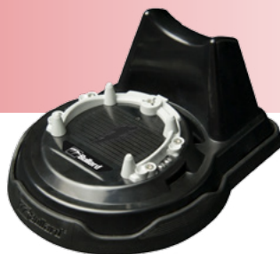
Wireless Desktop Charger (included as standard)