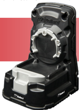
Wireless Truck Mount Charger