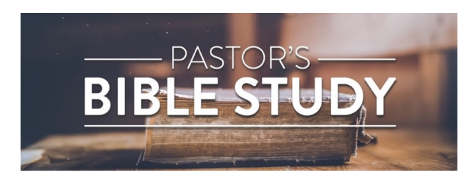
Tuesdays 6:30 pm Starting September 20th

Bible Study – Tuesdays, September 20<sup>th</sup> through November 15<sup>th</sup> – 6:30 pm at the Parsonage or via Zoom