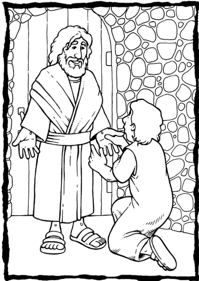
Thomas (John 20:19-29, CEB)