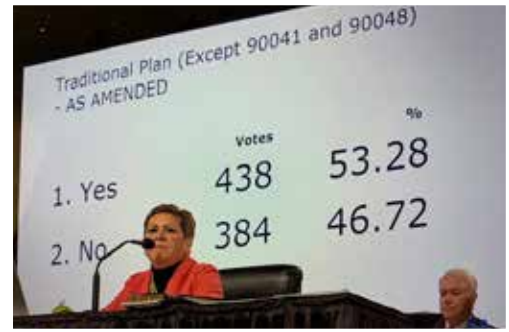
General Conference votes are in.