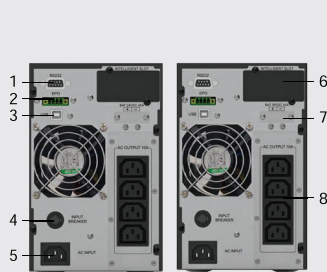
ATN TM11 1K(S)-HV