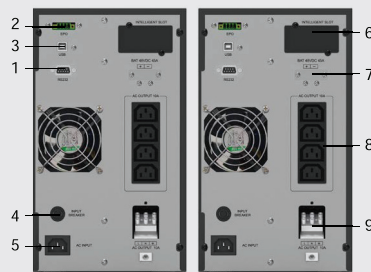
ATN TM11 2K(S)-HV