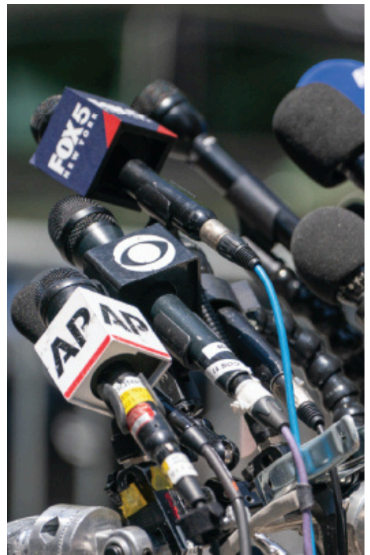
Microphones for a press conference outside New York City's Manhattan Criminal Courthouse in May 2024.