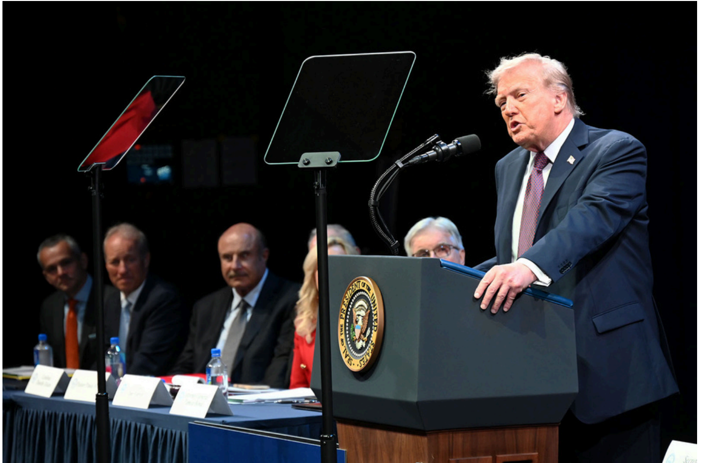
President Donald Trump speaks at a public hearing of the White House Religious Liberty Commission at the Museum of the Bible, Monday, Sept. 8, 2025, in Washington.

With a total of six decades of ministry between them, the Revs. Liz Ríos and Liz Mosbo VerHage were not surprised to learn that the vast majority of women ministers have faced misogyny.