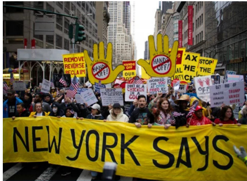
People take part in a nationwide "Hands Off!" anti-Trump protest in New York City on Saturday.