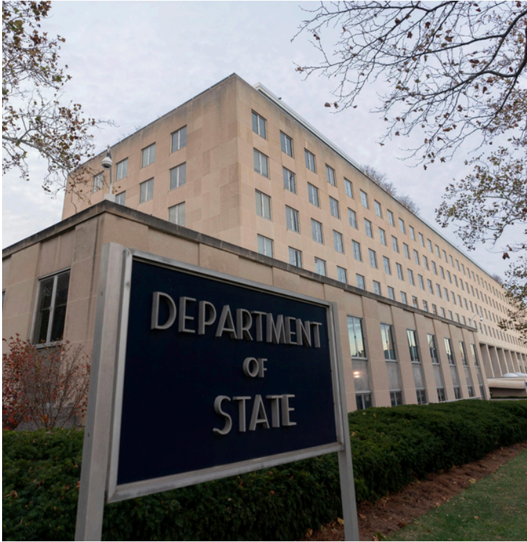
State department offices are connected with academic researchers by the Diplomacy Lab to conduct semester-long projects on foreign policy challenges.

The state department is proposing to suspend 38 universities including Harvard and Yale from a federal research partnership program because they engage in diversity, equity and inclusion (DEI) hiring practices, according to an internal memo and spreadsheet obtained by the Guardian.