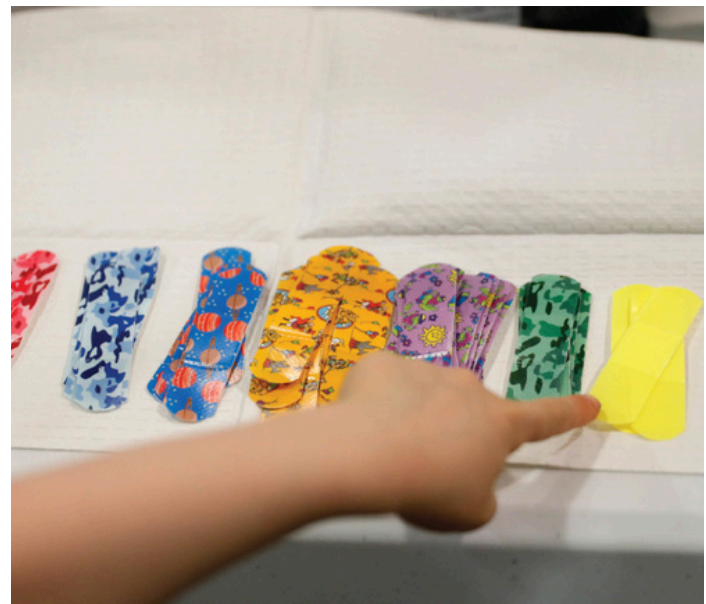
A 4-year-old boy picks out a bandage before getting vaccinated in San Jose, California, in 2022.