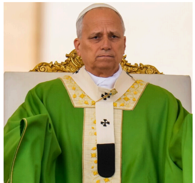
Pope Leo XIV presides over a Mass in St. Peter's Square.