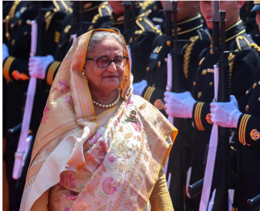
Moment Bangladesh tribunal sentences Sheikh Hasina to death for crimes against humanity – video

Hasina had pleaded not guilty to the charges and alleged the tribunal was a "politically motivated charade".