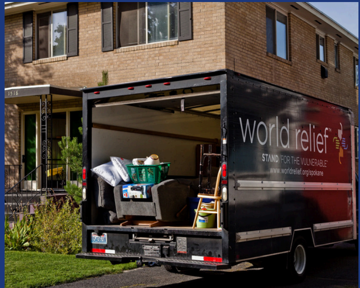
A World Relief moving truck with furnishings for a refugee resettlement home in Spokane, Washington.