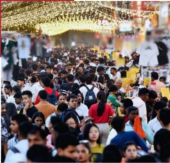
Representative image

People in middle-income countries are more likely to identify as 'religious nationalists' than those in high-income countries, but 'religious nationalists' do not make up a majority of the population in any of the countries surveyed, according to a new Pew Research Center report.