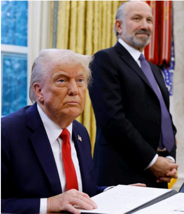
President Donald Trump, alongside Howard Lutnick, his nominee for Commerce Secretary, speaks to reporters in the Oval Office of the White House on February 3, 2025, in Washington.

President Donald Trump signed a pair of executive orders Thursday, one targeting the International Criminal Court and a second on “anti-Christian bias.”