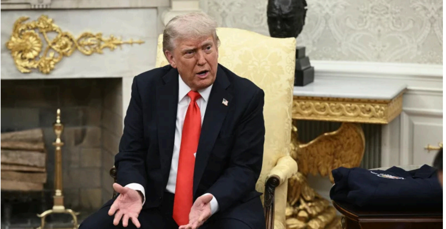
President Trump speaks to reporters in the Oval Office about the travel ban and other issues.

President Trump is banning travelers from 12 countries and partially restricting travelers from seven others, starting on Monday, June 9, a measure he said was necessary for national security.