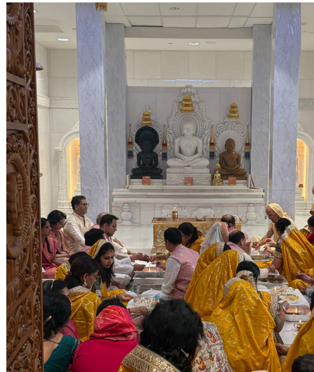
People attend the Param Pratishtha, or inauguration ceremony, of the new Jain Society of Metropolitan Washington temple complex in Beltsville, Md., Sunday, June 1, 2025.