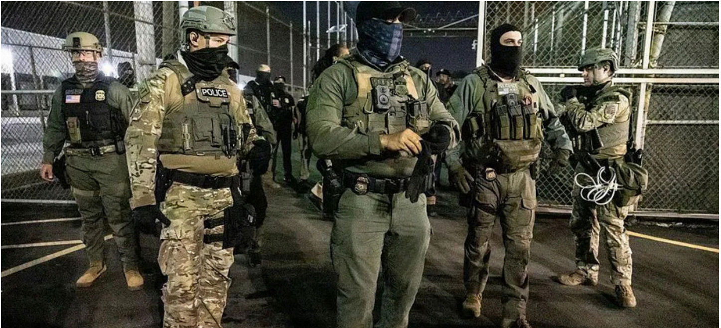
Trump's latest order comes amid a new wave of protests against his immigration policies

US President Donald Trump has ordered an expansion of the detention and deportation of migrants across the country as protests against his policies continue.