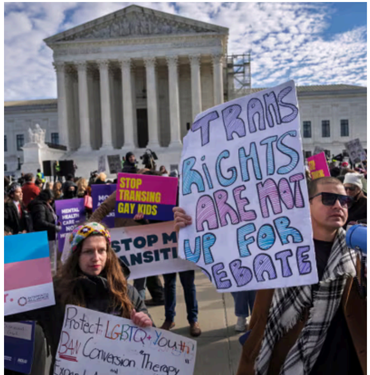
Supporters and opponents of transgender rights protest outside the supreme court on 4 December 2024.