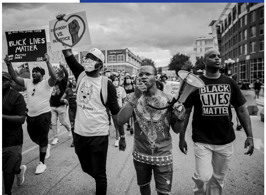
Men on a Protest (opens in a new tab or window.)