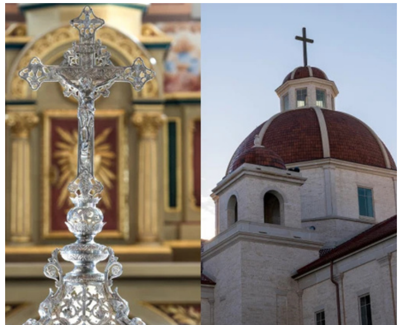
The Blessed Stanley Rother Shrine in Oklahoma City, the largest Catholic church in Oklahoma.