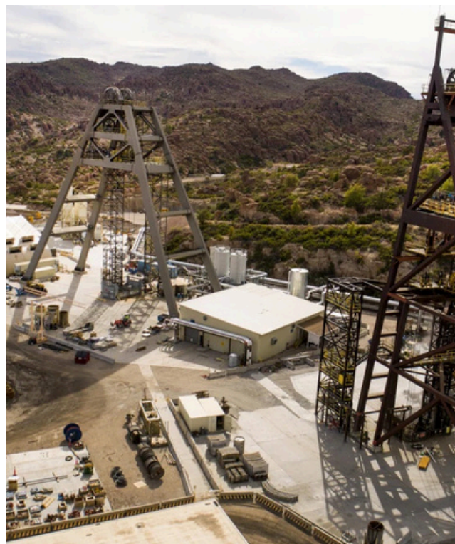
Resolution Copper's West Plant wants to exact copper from Oak Flat, a campground that is part of Tonto National Forest in Miami, Ariz., as seen in 2021.