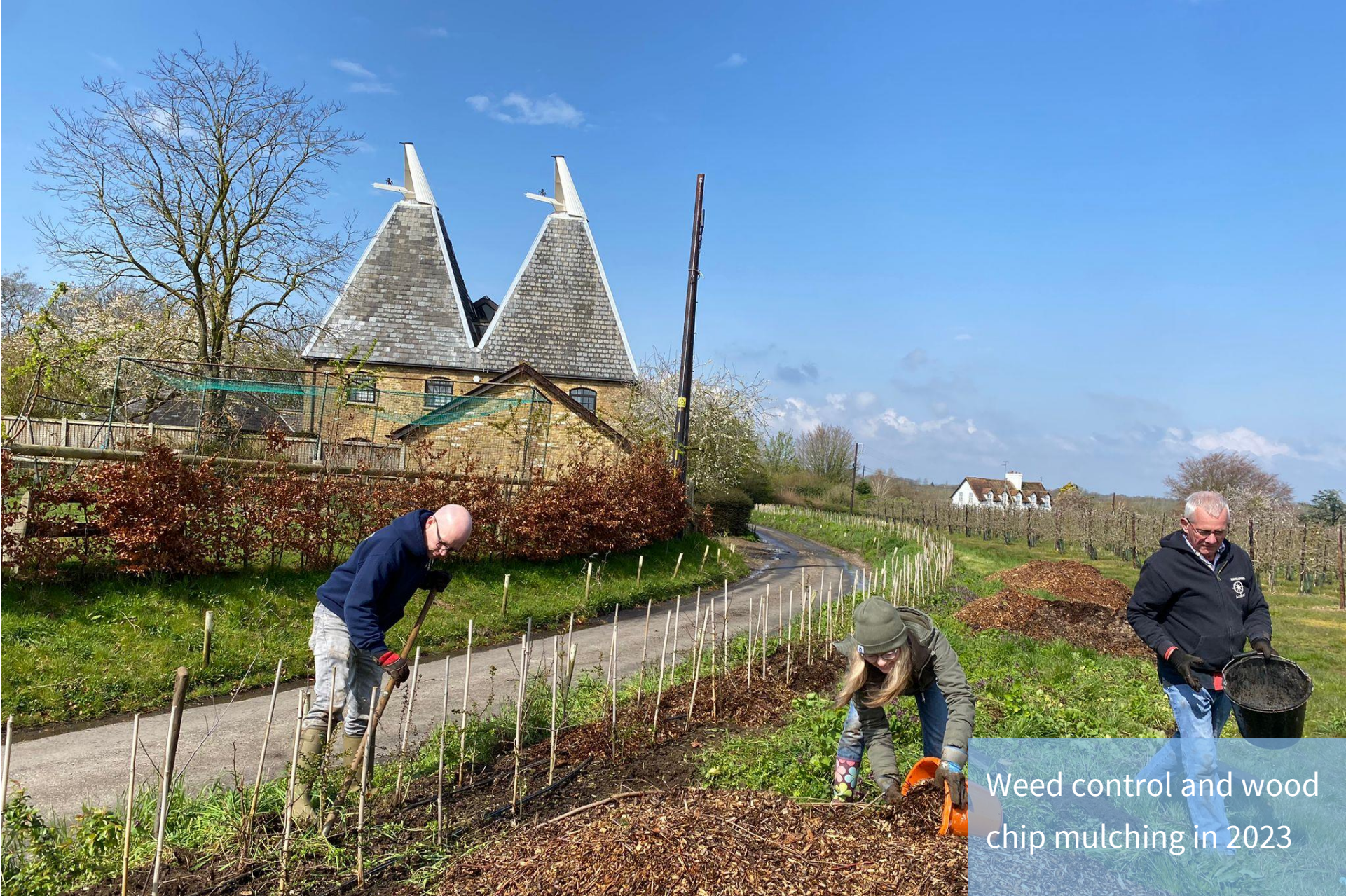
Weed control and wood chip mulching in 2023