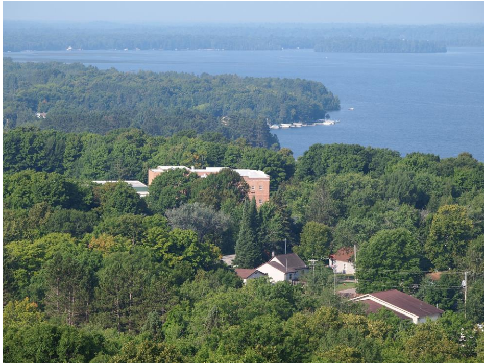
View From Fire Tower