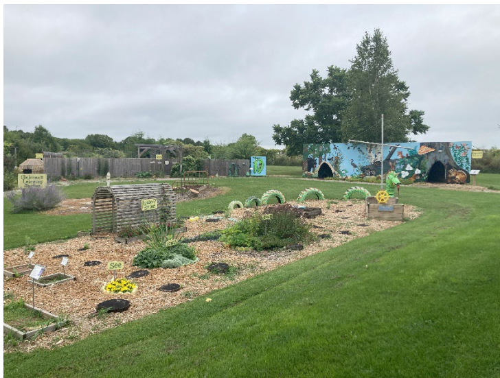
The Children's Learning Garden in the Harmony Demonstration Gardens.

Answer: Northern Lights Master Gardeners Association Inc (NLMGAI) was formed, incorporated, and obtained 501c3 status with the IRS in 2022. NLMGAI has an agreement with Marinette County for the use of the Demonstration Gardens at Harmony Arboretum. The Northern Lights Master Gardeners maintain and develop the Gardens through an agreement with Marinette County which owns the property. These Gardens are used for horticultural education and demonstrate the species which will thrive in the climate of Northeastern Wisconsin. The Gardens also demonstrate how to use native plants in landscaping to support the local ecosystem. There is an extensive Children's Learning Garden and educational programs which improve the quality of life for families with young children. There is also an Enabling Garden to demonstrate how elderly and gardeners with disabilities can grow plants in raised beds. NLMGAI has conducted local horticultural education since its incorporation. Efforts have included a garden conference (200 attendees), garden walks (local private gardens), education classes throughout the county (third largest in area in Wisconsin), children's events (seed "bombs", seed starting, art in the gardens), member education, adaptive technology for gardening education, and enrichment events for individuals with disabilities.