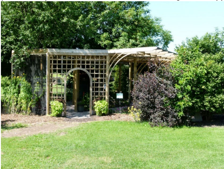
Shade House Garden at Harmony Demonstration Gardens

The paving portion of the project will facilitate access for mobility limited visitors to the Enabling Garden and the covered pavilion where educational events are conducted. The replacement of the pump building will permanently remove the hazard while ensuring water supply for the Gardens.