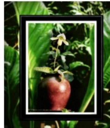
L: Robert Mapplethorpe, Hyacinth, 1987. M: Patti Smith and Robert Mapplethorpe IV, 1969, R: Conceptual of Horticultural Installations