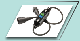
PRCD On-board Charger