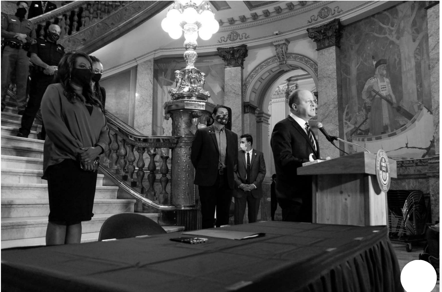
Colorado Gov. Jared Polis speaks moments before signing Senate Bill 217, a sweeping police accountability bill, into law at the Colorado Capitol on Friday, June 19, 2020.

Here are some of the most important parts of the legislation: