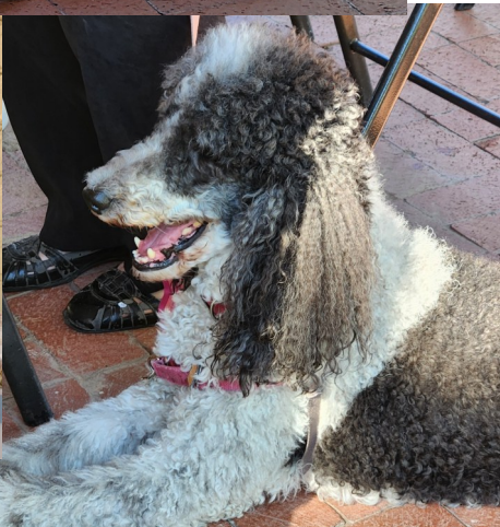
Moose had a great time doing the Puppy Apple Bobbing and entertaining the crowd.