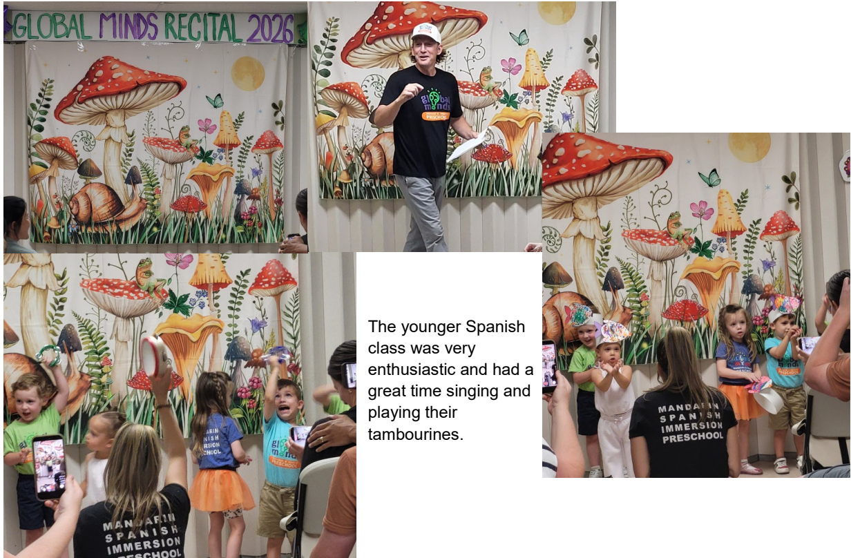
The younger Spanish class was very enthusiastic and had a great time singing and playing their tambourines.