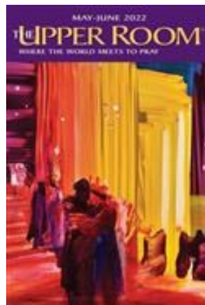
Pick up the latest issue!

East District Prayer Focus for May Wesley & Golden Gates Community Centers, Phoenix UMOM New Day Center, Phoenix Justa Center, Phoenix