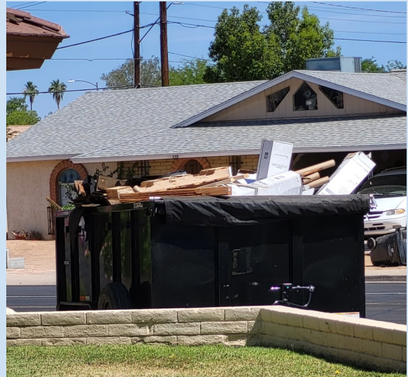
Sanctuary roof repairs

The trustees are staying busy keeping the campus in shape. The best news is that the sanctuary roof has been repaired, and we beat the monsoon! The repairs were done during the week and caused little disruption (but lots of trash!).