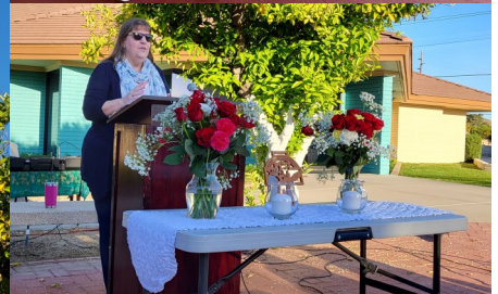
Top Row—Palm Sunday Middle—Easter early service Bottom—Easter in the Sanctuary