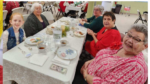
The ladies enjoyed their tea at the beautifully decorated tables!