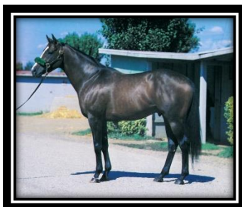
PIRATEER Stakes winner of $108,463