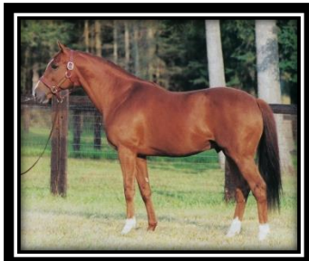
HANDSOME ONE Major stakes winner of $387,575

Book online at www.wildwoodfarmbandb.com