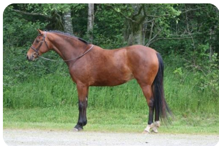
Domatilla French Dancer X Libero Star

and in 2009 had a beautiful colt we named Cedric, who was purchased back by the stallion owner as a Western Dressage horse. In 2010, her final breeding year, she was bred to an imported Irish Draught named Ofally and in 2011 had a beautiful chestnut filly we named Fallon who went on to become a very talented hunter. French Dancer is not only registered with the Jockey Club, but also with the American Warmblood Society where she received the Red Preferred status at inspection with a score of 75.4. Today at age 20 she lolls around in the big field with Luna and Babe, retired from breeding. She appreciates her human caretakers but is very wary of strangers and can appear aloof at times, although she is kind, intelligent and more beta than alpha in the herd.