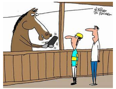
"We have a problem. He spends more time tweeting about himself than training for the Kentucky Derby."