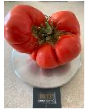
Red Penna 685g