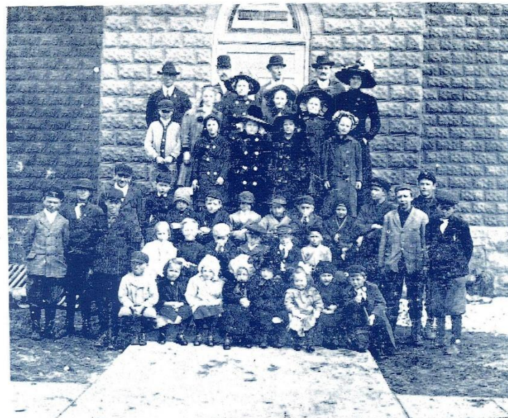
The Eden Sunday Church School of 1907.