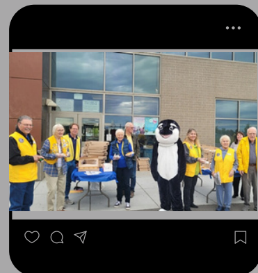
Donuts with Grown Ups Amistad Elementary