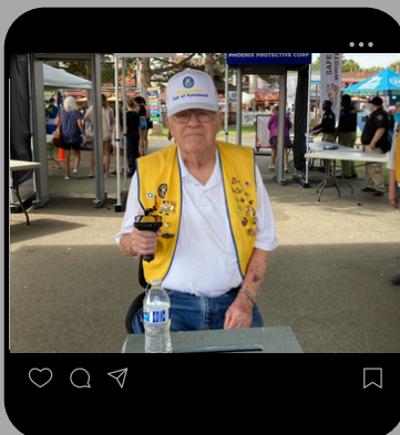
40+ Years of Fair Service