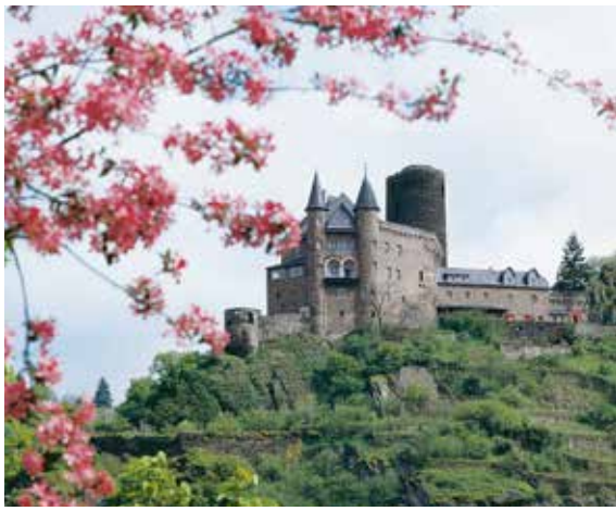
KATZ CASTLE, GERMANY