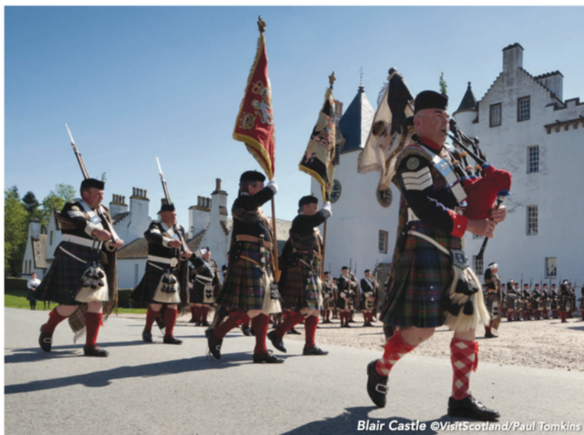
Blair Castle