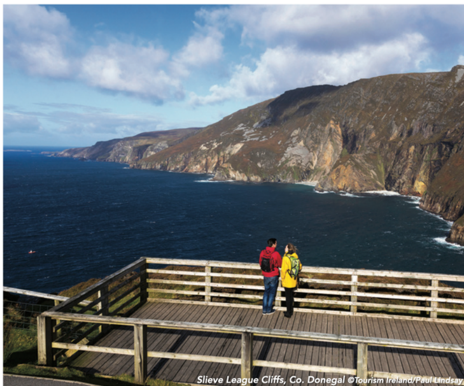
Slieve League Cliffs, Co. Donegal