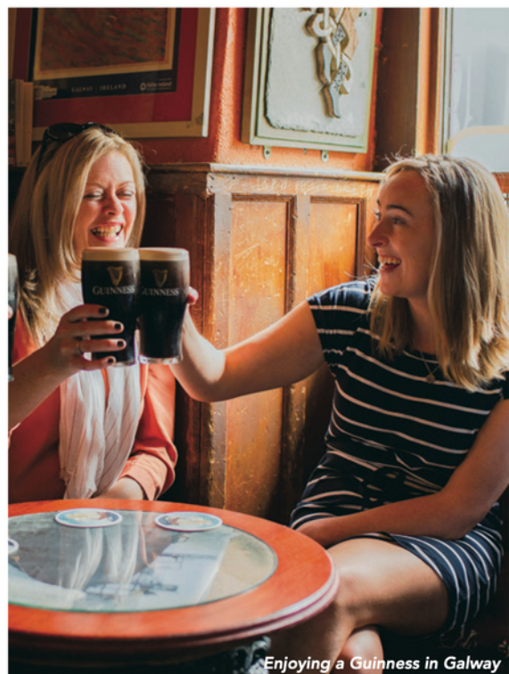
Enjoying a Guinness in Galway

All prices are per person, land only, based on double occupancy in USD and vary by departure date and availability. Prices, attractions and itineraries are subject to change.