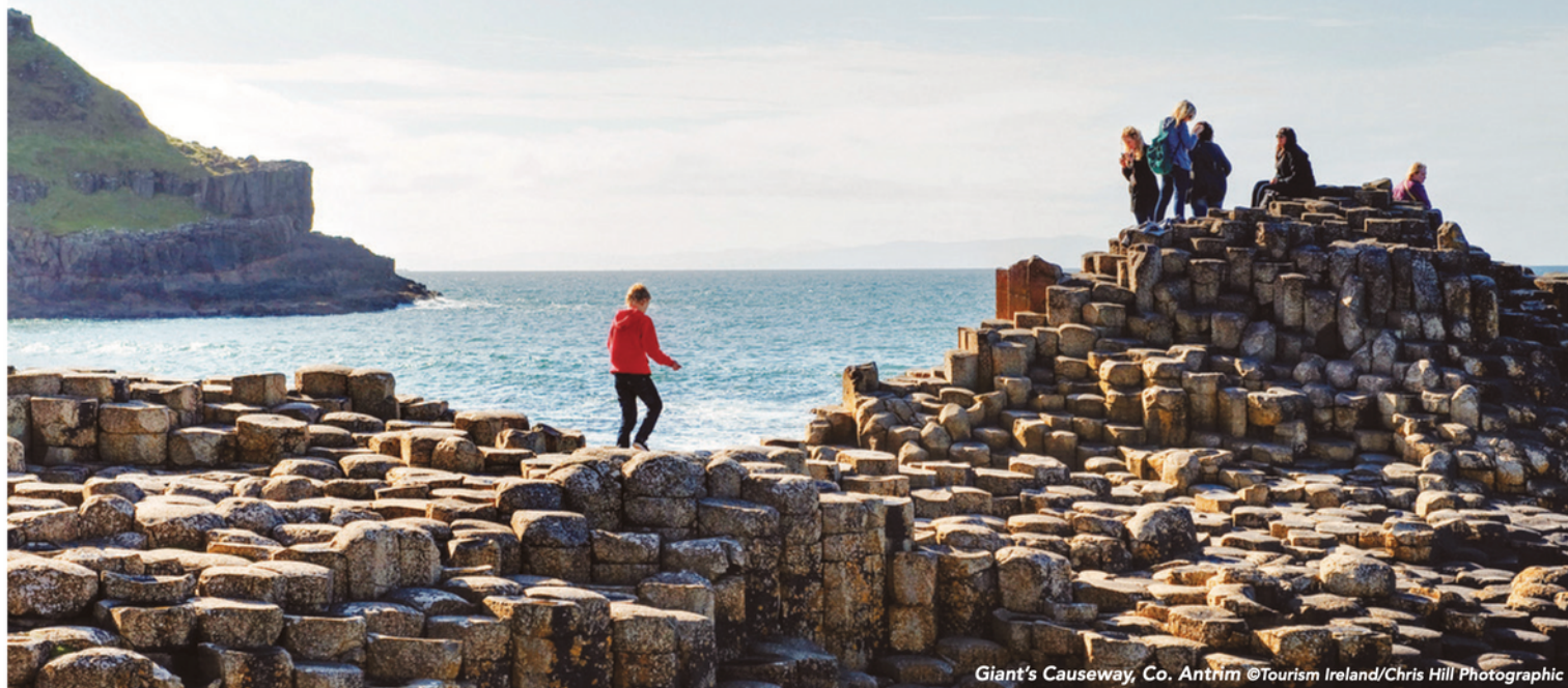
Giant's Causeway, Co. Antrim