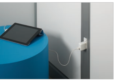
Inline Connectors support power and data vertically for access at multiple heights.