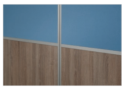
Slim-profile Inserts offer many decorative and functional options.