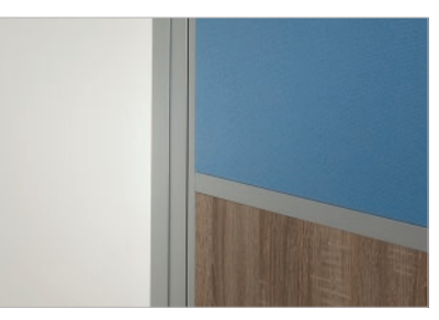
Adjustable Wall Starts provide flexibility to cleanly attach and adjust to walls, columns, and other architectural conditions.