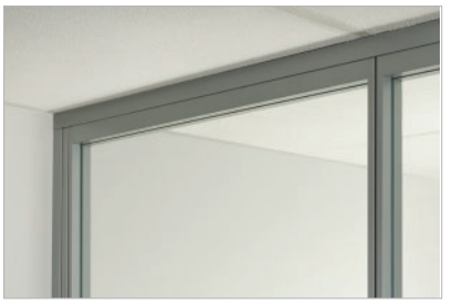
Traditional Crown stands slightly proud of the wall panel. Required for freestanding applications.