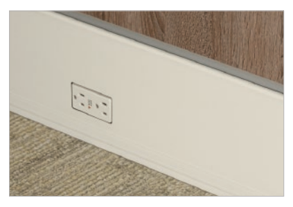
Power and data is distributed and accessed horizontally in the 6" base option.