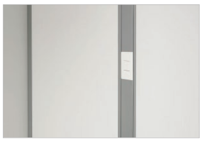
Inline Connectors can be specified with factory-cut openings to accommodate your choice of components.