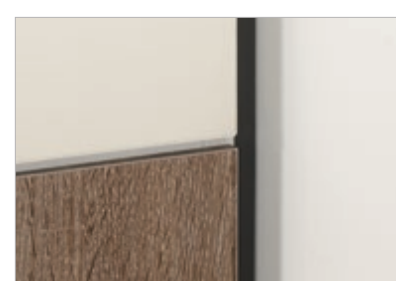
Volo has the capacity to provide acoustic privacy as good as or surpassing drywall.