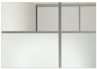
Volo offers Clear, Low Iron, Frost, magnetfriendly, Back Painted glass and writable glazing options.