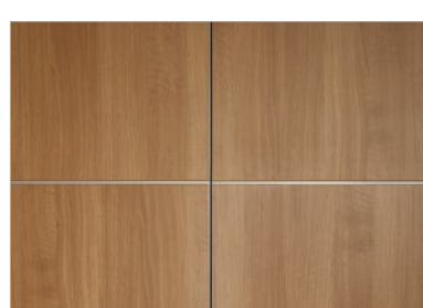
Outserts sit slightly proud of the frame and display a subtle 1/4" reveal.