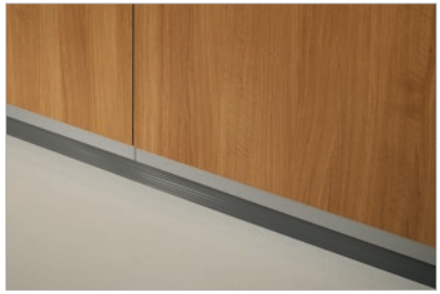
2" Vinyl Base creates a subtle recessed transition to the floor.