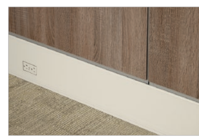
6" Vinyl Base accommodates horizontal modular power.