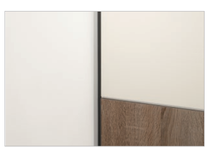
Reveal Wall Starts provide a subtle, recessed wall interface.