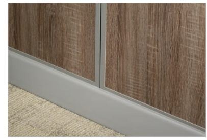
4" Vinyl Base frames the panel and resembles a commercial cove base.