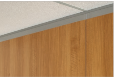
Reveal Crown creates a subtle ceiling attachment transition.