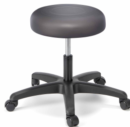
Fusion Round Stool R+