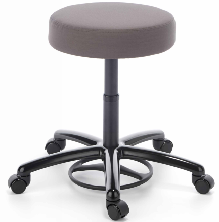
Fusion Round Stool

Slightly smaller footprint, same quality and proven performance