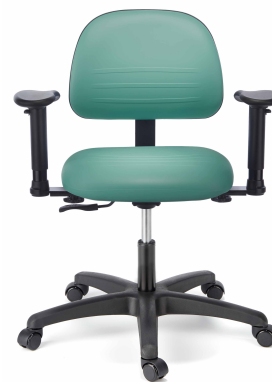
Fusion Fit R+