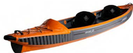
EXPLORER DOUBLE SEATER