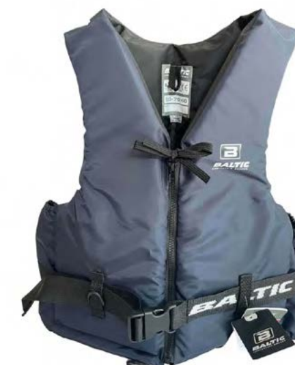
BALTIC AQUA PRO BUOYANCY AID NAVY BLUE / RED