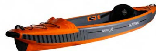
EXPLORER SINGLE SEATER INFLATABLE KAYAK