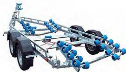
EXT2400 FIXED KEEL Suitable for - Cornish Crabber Shrimper 21