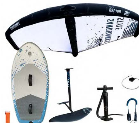
COMPLETE WING FOIL STARTER PACKAGE