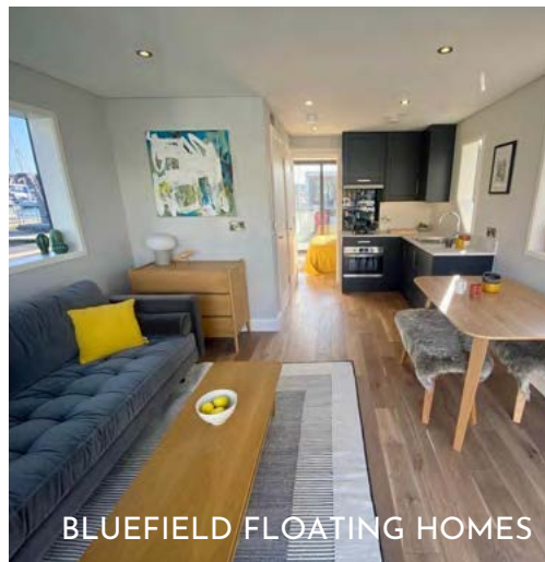
BLUEFIELD FLOATING HOMES