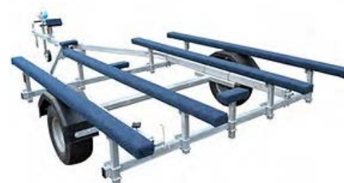
EXT750 INFLATABLE Extreme 750kg Inflatable Boat Trailer. Suitable for - Inflatable Boats up to 5.3m in length