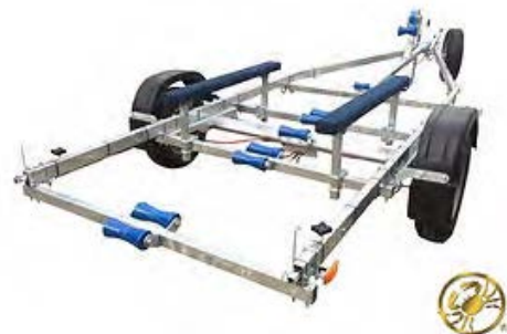
EXT1300 FIXED KEEL Suitable for - Cornish Crabber Shrimper 17