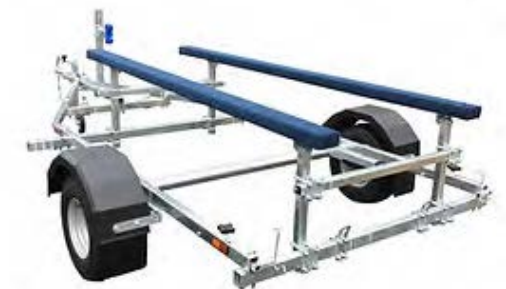
EXT750 CAT Extreme 750kg Cat Boat Trailer. Suitable for - Catamarans up to 4.2m in length