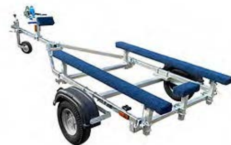
EXT300 INFLATABLE Extreme 300kg Inflatable Boat Trailer. Suitable for - Inflatable Boats up to 3.50m in length

FIND OUT MORE: https://www.extreme-trailers.co.uk/inflatable