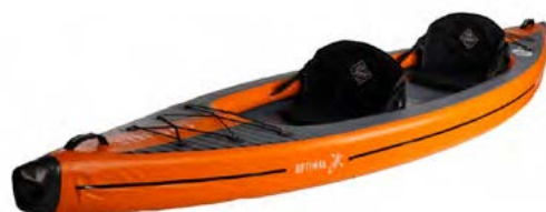
OPTIMAL DOUBLE SEATER INFLATABLE KAYAK