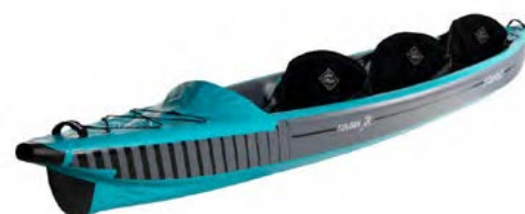
EXPLORER TRIPLE SEATER INFLATABLE KAYAK