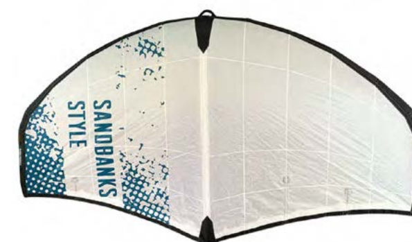
RAPTOR WING - 5M