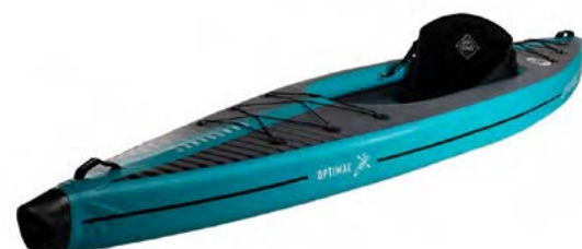
OPTIMAL SINGLE SEATER INFLATABLE KAYAK