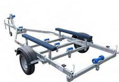
EXT750 FIXED KEEL Suitable for - Fixed Keel Boats up to 16' in length

FIND OUT MORE: https://www.extreme-trailers.co.uk/fixed-keel-range