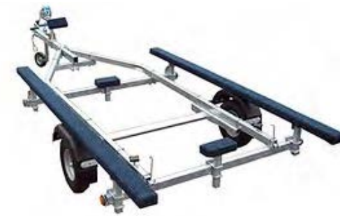
EXT500 INFLATABLE Extreme 500kg Inflatable Boat Trailer. Suitable for - Inflatable Boats up to 4.5m in length