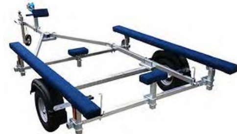
EXT350 INFLATABLE Extreme 350kg Inflatable Boat Trailer. Suitable for - Inflatable Boats up to 3.80m in length