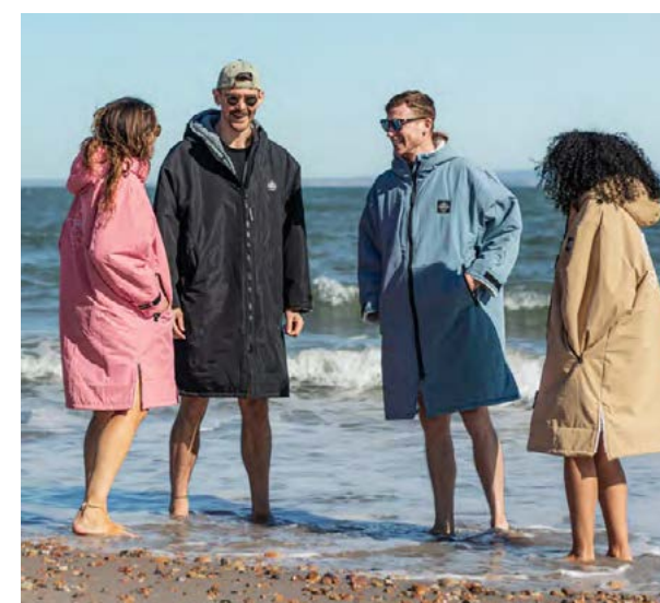
SHERPA CHANGING ROBE- VARIOUS COLOURS