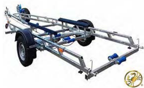
EXT1500 FIXED KEEL Suitable for - Cornish Crabber Shrimper 19