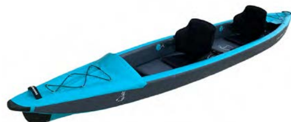
EXPLORER DOUBLE SEATER INFLATABLE KAYAK (2024 MODEL)

https://www.sandbanksstyle.com/collections/kayaks