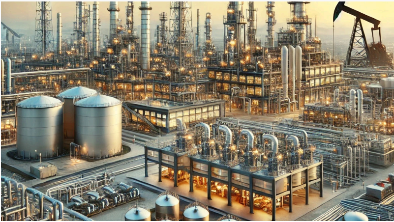
OIL, GAS & PETROCHEMICALS