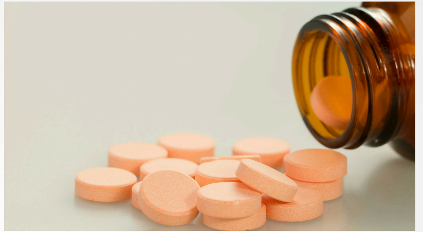
CHEMICAL AND PHARMACEUTICALS