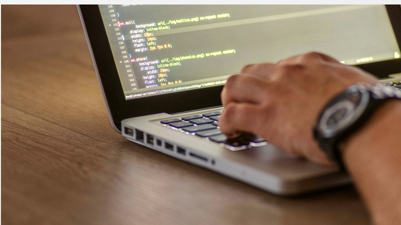
IT AND ELECTRONICS