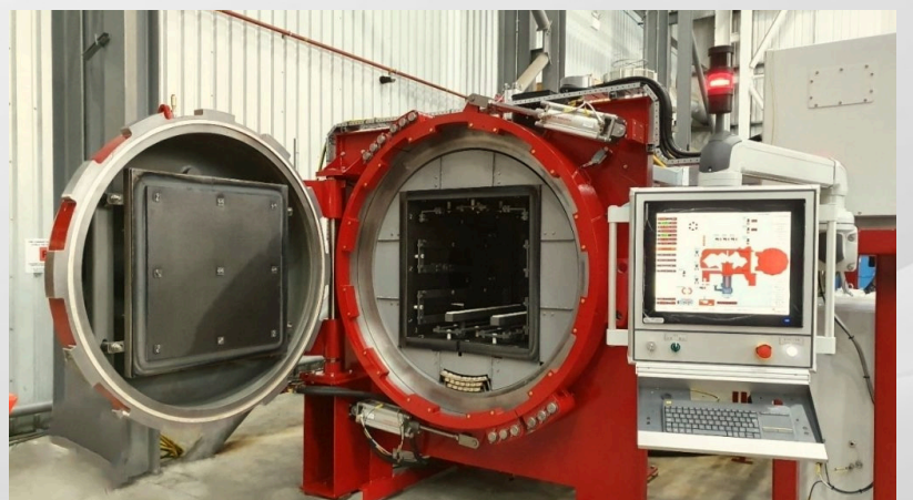
METAL & MINING