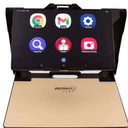
PATRIOT VRM 15