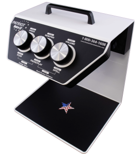
PATRIOT VOICE EZ