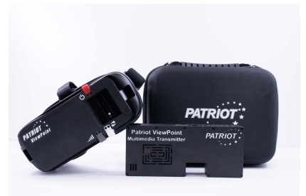
PATRIOT VIEWPOINT MULTIMEDIA