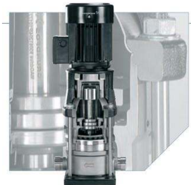
Grundfos CR Series of pumps

Hi , I am sure that you are familiar with Grundfos Vertical In Line Multistage Centrifugal Pumps, if not, Grundfos is one of the largest pump companies in the world. Grundfos is distributed in Western Canada by Arndt Motor and Pump. Arndt Motor and Pump has the largest inventory of Grundfos pumps and parts in Western Canada and has the service team to handle any type of service. What I wanted to do today, was to let you know what is new at Grundfos and how it can help you with your pumping needs.