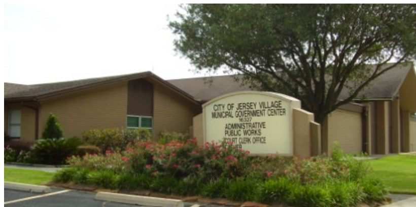
Jersey Village City Hall