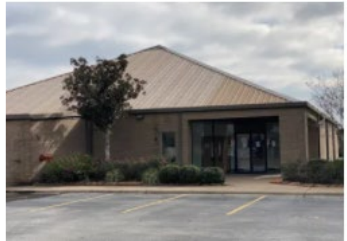
Jersey Village Civic Center