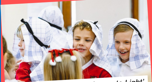
Pupils joining in at 'Darkness to Light'

Both lessons encourage pupils to WONDER: noticing the amazing moments in the story, asking questions about what was going on, and seeing how the story is about LIGHT coming into the DARKNESS. We thank God for the amazing depth and imagination in the responses from the children (and school staff!)