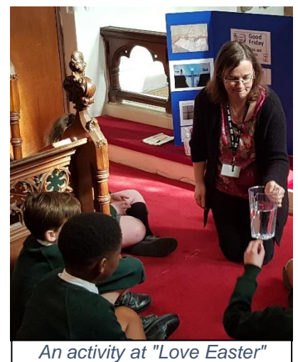
An activity at "Love Easter"

We have also extended our Christmas and Easter projects this year. In addition to helping pupils in Years 5 and 6 to explore the Biblical Christmas and Easter stories through our Christmas Wonder and Love Easter projects, we re-introduced our Darkness to Light and Sadness to Joy lessons for Years 1 and 2, also exploring Jesus' birth and death/resurrection respectively.