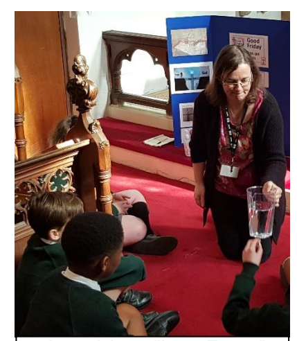
An activity at "Love Easter"

We have also extended our Christmas and Easter projects this year. In addition to helping pupils in Years 5 and 6 to explore the Biblical Christmas and Easter stories through our Christmas Wonder and Love Easter projects, we re-introduced our Darkness to Light and Sadness to Joy lessons for Years 1 and 2, also exploring Jesus' birth and death/resurrection respectively.