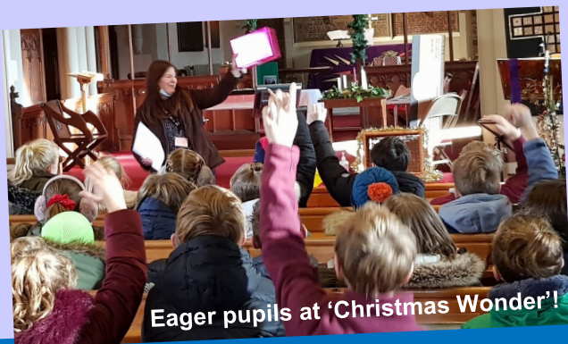
Eager pupils at 'Christmas Wonder'!