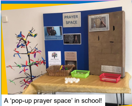
A 'pop-up prayer space' in school!