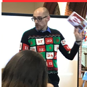
Christmas Unwrapped last year!

We have led various Christmas lessons for primary schools for many years, including Christmas Unwrapped for year 6 pupils, then adding the Darkness to Light workshop for infants and, more recently, Christmas Prayer Spaces too. This year, our Christmas projects are changing and adapting again!