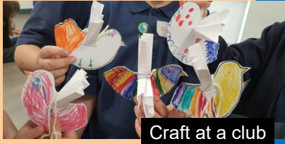
Craft at a club

At Warley we have a mixture of children from years 1 to 6, who come at different times through their staggered lunchtime! There is a ten-minute slot in the middle when they are all present, and we play a game together and tell them the story for the day, and the rest of the time is spent on a craft linked to the theme of the day. This term we are looking at stories about Jesus, from his birth through to his teachings. Our clubs cannot run without help from our amazing volunteers. We are so thankful for those who help us on these club teams and we are looking out for new volunteers to help us start up more clubs!