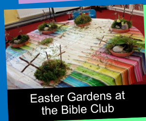
Easter Gardens at the Bible Club