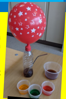
A resilience group activity