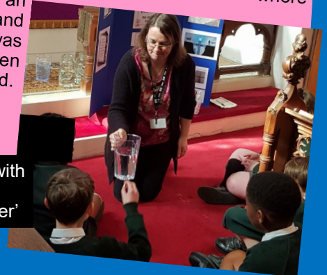
Reflecting with pupils at 'Love Easter'