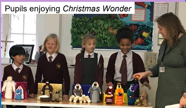
Pupils enjoying Christmas Wonder