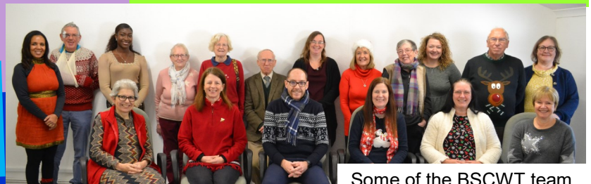
Some of the BSCWT team

PRAY: We believe praying for our local schools, children and young people is really important. Please contact us to: