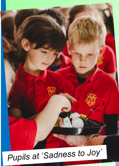
Pupils at 'Sadness to Joy'

"Your ability to bring the Easter Story to life was incredible. Talking to the children afterwards revealed a fountain of new learning they had gained."