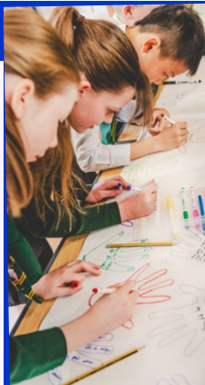
Pupils at 'Love Easter'