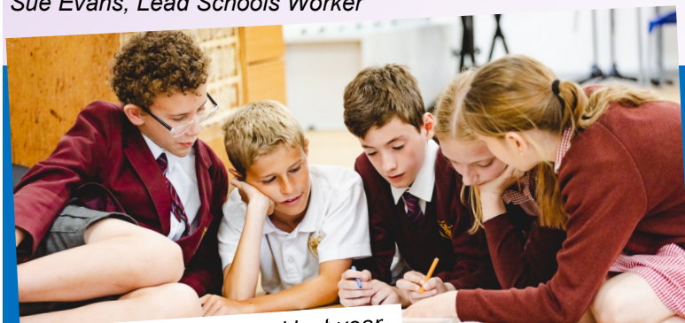
Pupils at 'It's Your Move' last year