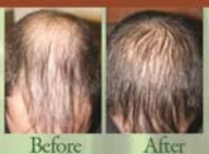
Actual Helendale NeoGraft Hair Replacement Patient.