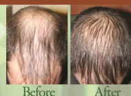
Actual Helendale NeoGraft Hair Replacement Patient.